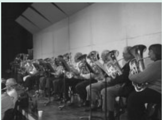
Members of the euphonium section at the 2006 MSU Alumni Concert Band Reunion.