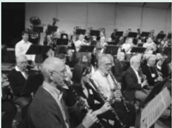
Members of the clarinet section at the 2006 MSU Alumni Concert Band Reunion.