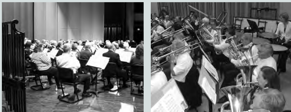
Attendees of the 2011 Concert Band Spring Reunion perform at East Lansing High School on May 1st. To view more photos visit our web site at: www.msualumniband.com .